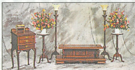
Queen Anne Collection

ed Howard Miller, Hekman and Woodmark dealer.